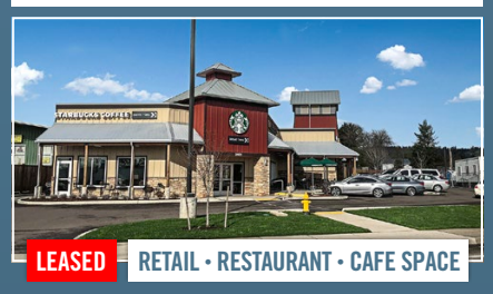
Starbucks- Anchord Retail Development (2017) 9,800+ SF Commercial | 1 Building | Newberg OR